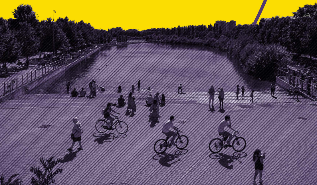
Parco Nord Milano

Assemblea Permanente dei Cittadini sul Clima